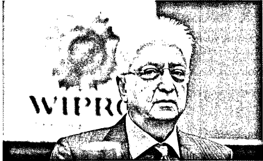
New venture: Wipro chairman Azim Premji. The Foundation has signed a pact with the Tata Institute of Social Sciences to set up the Azim Premji School of Education.